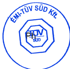
ÉMI TÜV SÜD Ltd.